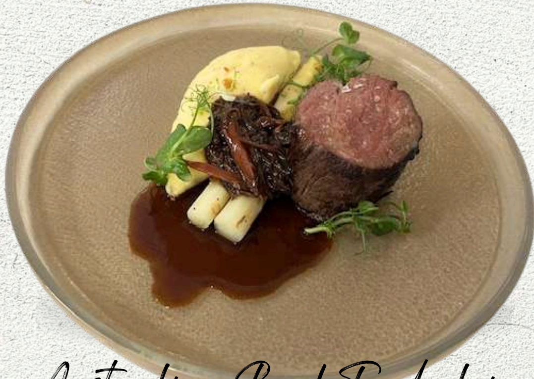
Australian Beef Tenderloin Braised Oxtail, Goat's Cheese and Truffled Mashed Potatoes, White Asparagus, Natural Jus (A, L)